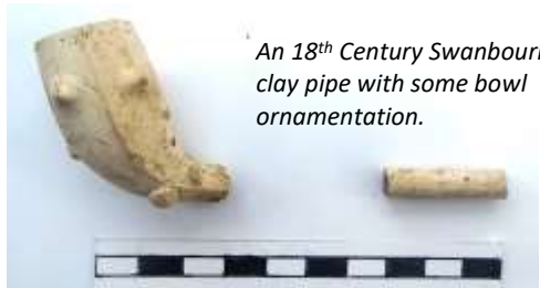
An 18 th Century Swanbourne clay pipe with some bowl ornamentation.

Photo (above right) is another clay pipe from Swanbourne with a more upright, ornamented bowl suggesting an 18 th Century age. This identification has also been verified by Bucks Museum.