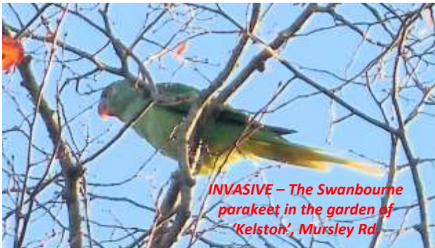
INVASIVE – The Swanbourne parakeet in the garden of ‘Kelston’, Mursley Rd

PARROTS - In recent months, many of us will have noticed at least one wild “parrot” very happily living in Swanbourne. It’s actually a ring-necked parakeet, a bird which is native to the Indian sub-continent and sub-Saharan Africa. So, what’s it doing in Swanbourne and how did it get here? Well, we don’t know for certain, but in the late 1960s and early 1970s, a few pet birds escaped from private collections and went into London. Then they began to breed and spread out, with their population in Britain now thought to be around 7,500 birds.