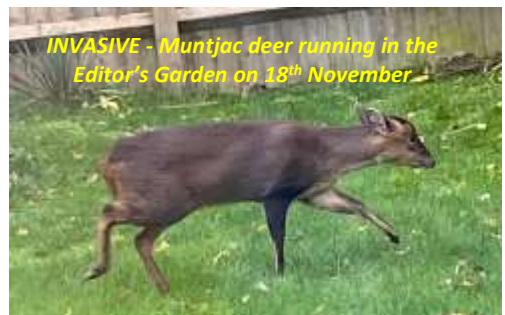
INVASIVE - Muntjac deer running in the Editor’s Garden on 18 th November

DEER - The muntjac deer was introduced from Asia to Woburn Park in Bedfordshire at the start of the 20 th century and rapidly spread into the surrounding area. It is now a common animal across southeast England and can be found in woodland, parkland and even gardens. Another invader which may be seen locally is the Chinese water deer.