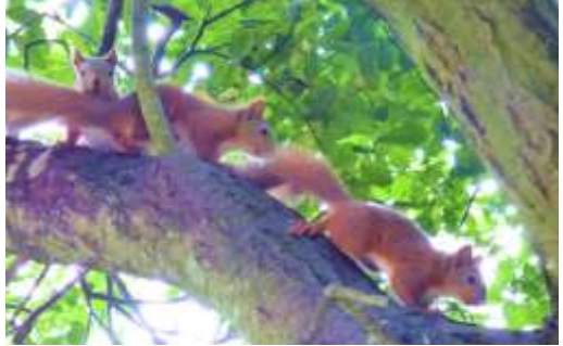
Above: NATIVE red squirrels were forced out of Swanbourne by the greys. Photographed in the Isle of Wight.

red squirrel. In Swanbourne, greys had replaced reds by the 1950s and there are only few populations of reds left in England and Wales - mainly in the Lake District and island outposts of Anglesey and the Isle of Wight. Thankfully, the reds are still relatively common in Scotland. Unlike the reds, the greys often strip bark from trees, damaging and even killing them. Hence, greys are classed as pests and it is legal to humanely reduce their numbers.