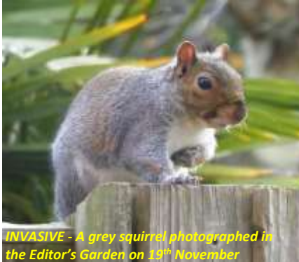
INVASIVE - A grey squirrel photographed in the Editor's Garden on 19 th November

SQUIRRELS - Originally a native of North America, grey squirrels were released in Great Britain in 1876 carrying a squirrel pox virus which is usually fatal to out native